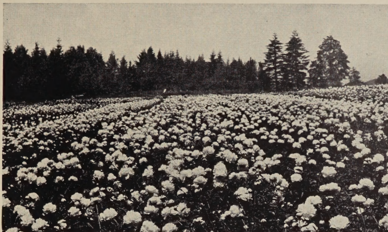
A Portion of Our Planting at Blossom Time